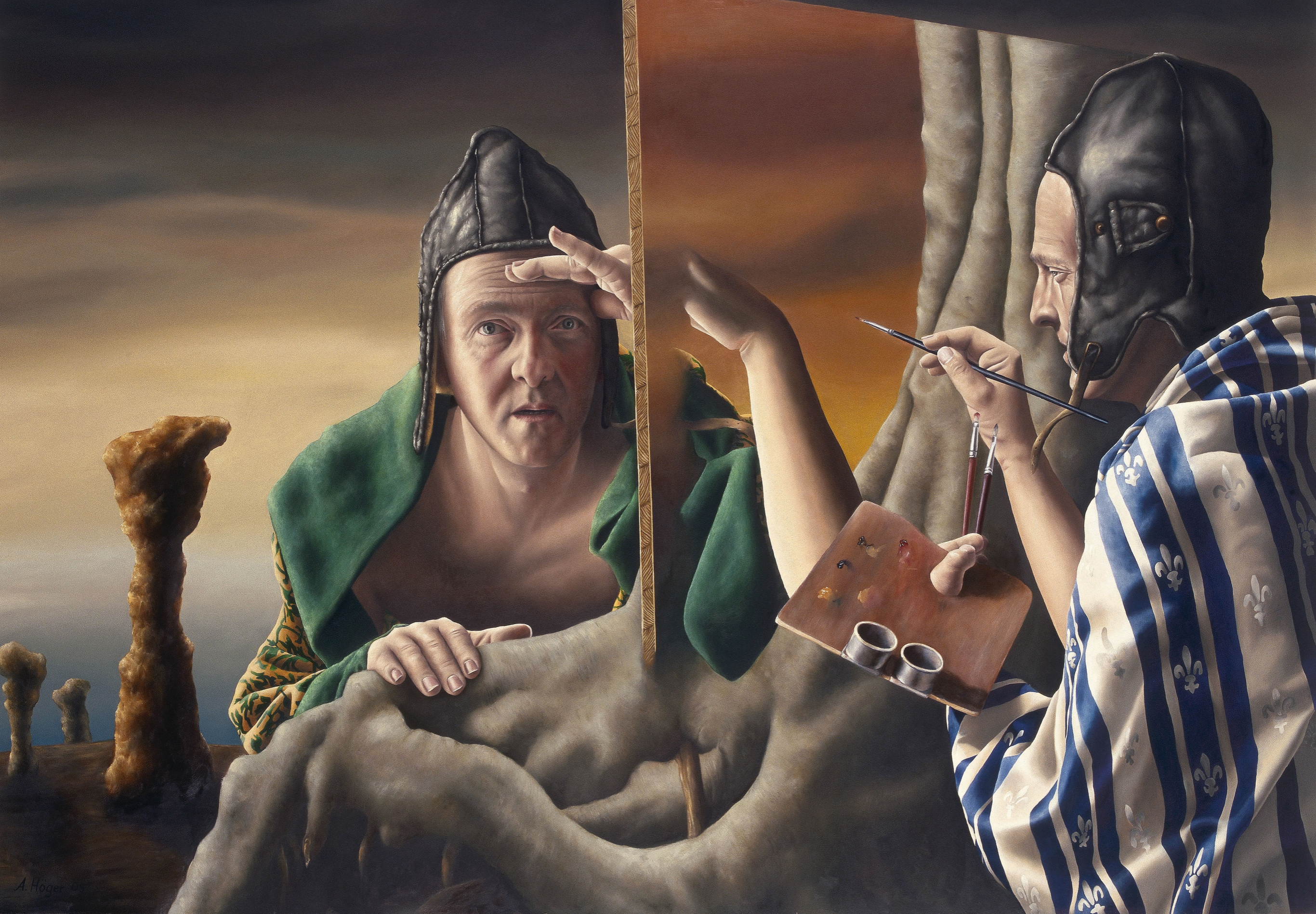
The King paints ... Oil on wood 90 cm x 130 cm 2005