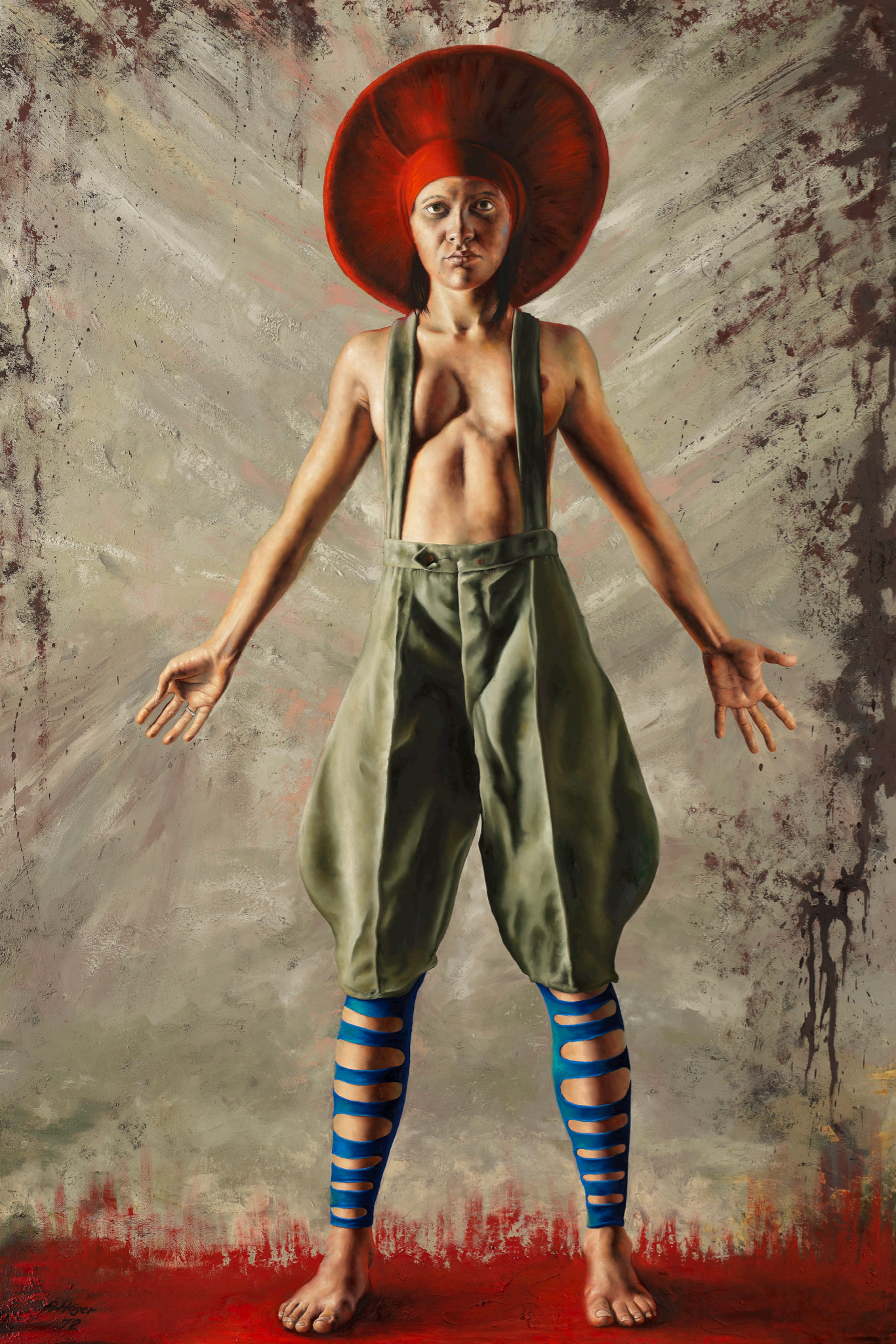
Little Red Riding Hood Oil on canvas 180 cm x 130 cm 2012