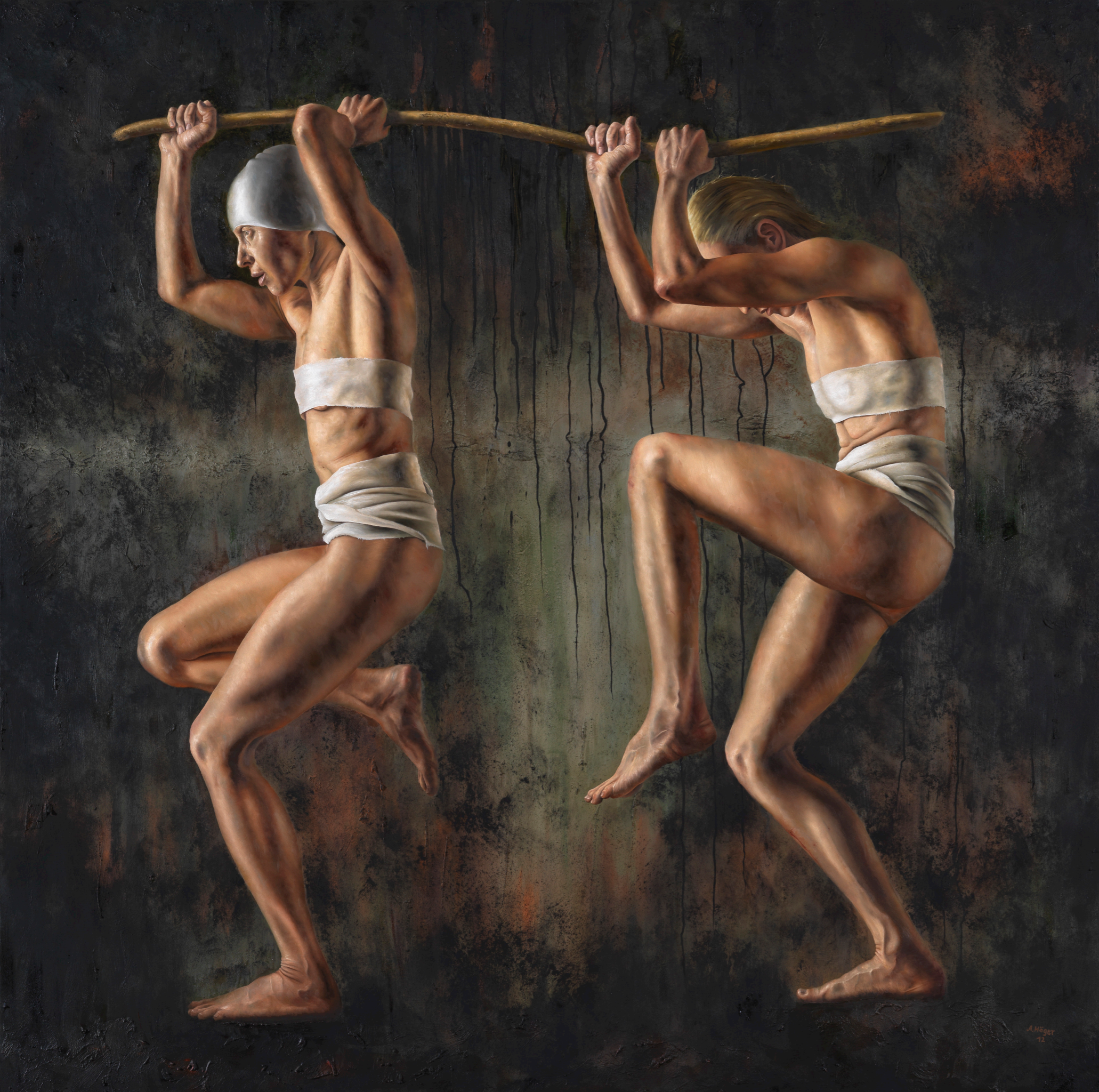
The Burden Oil on canvas 180 cm x 180 cm 2012