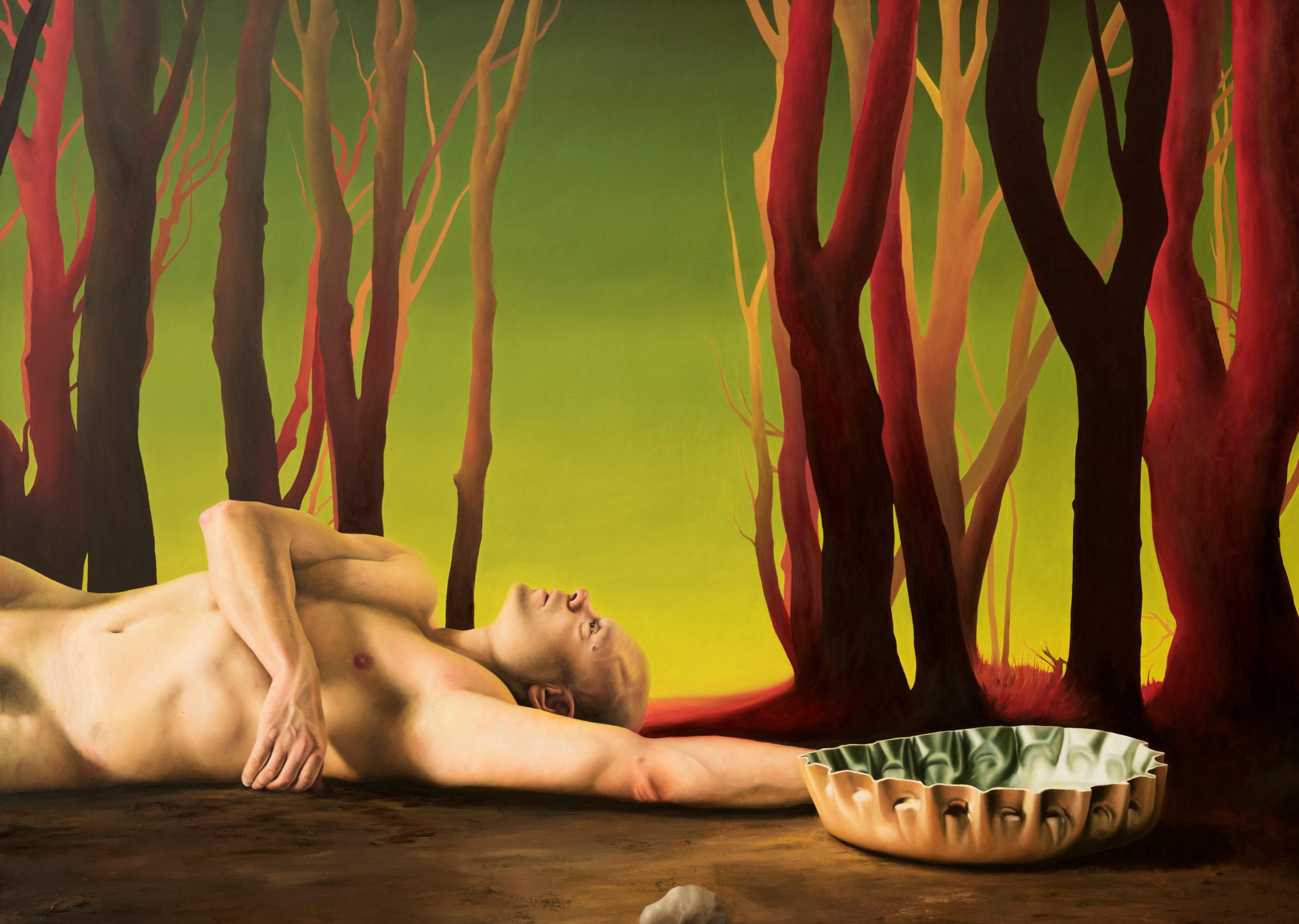
K... is saving the Wood