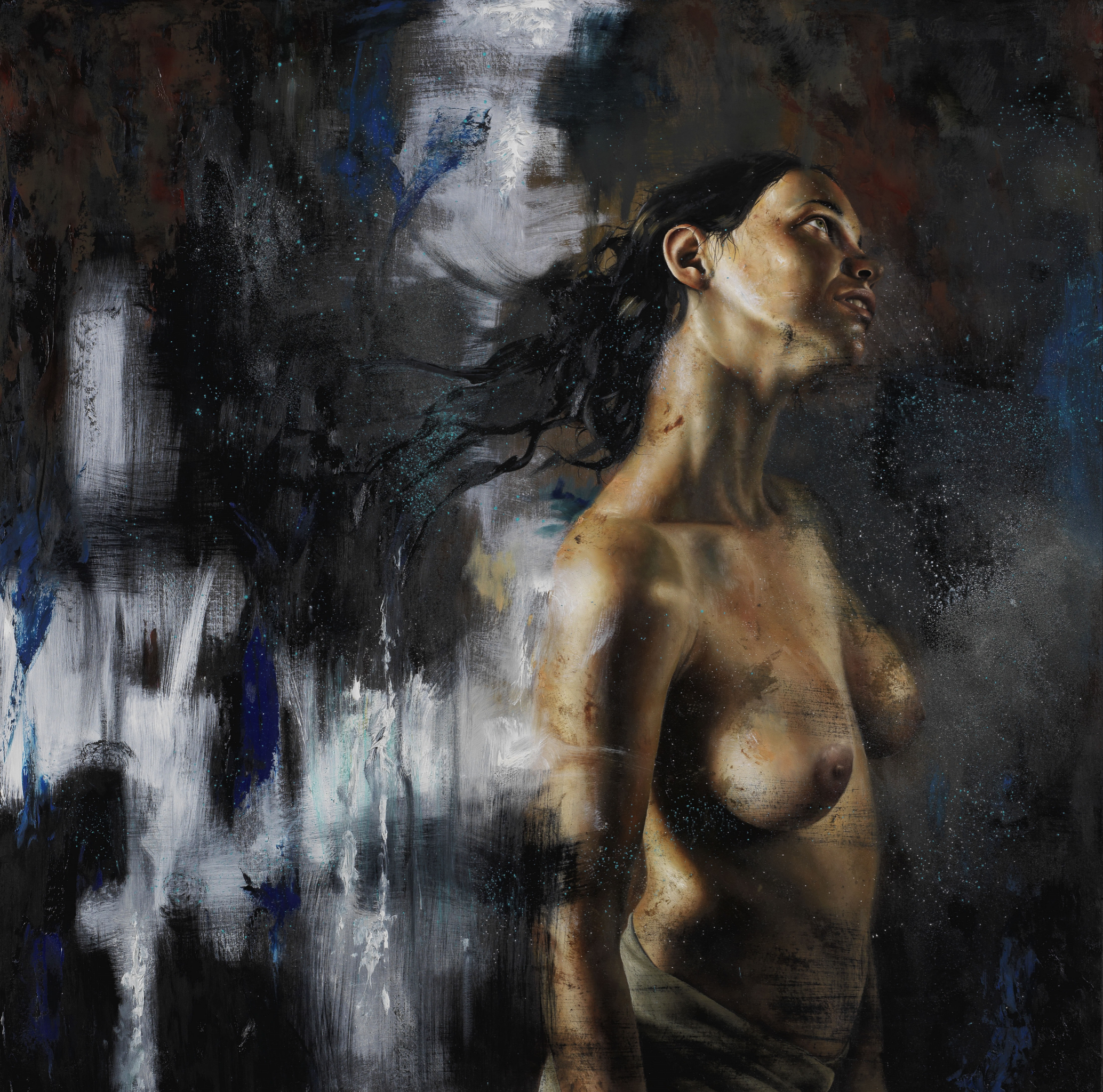
The Birth of the Venus II