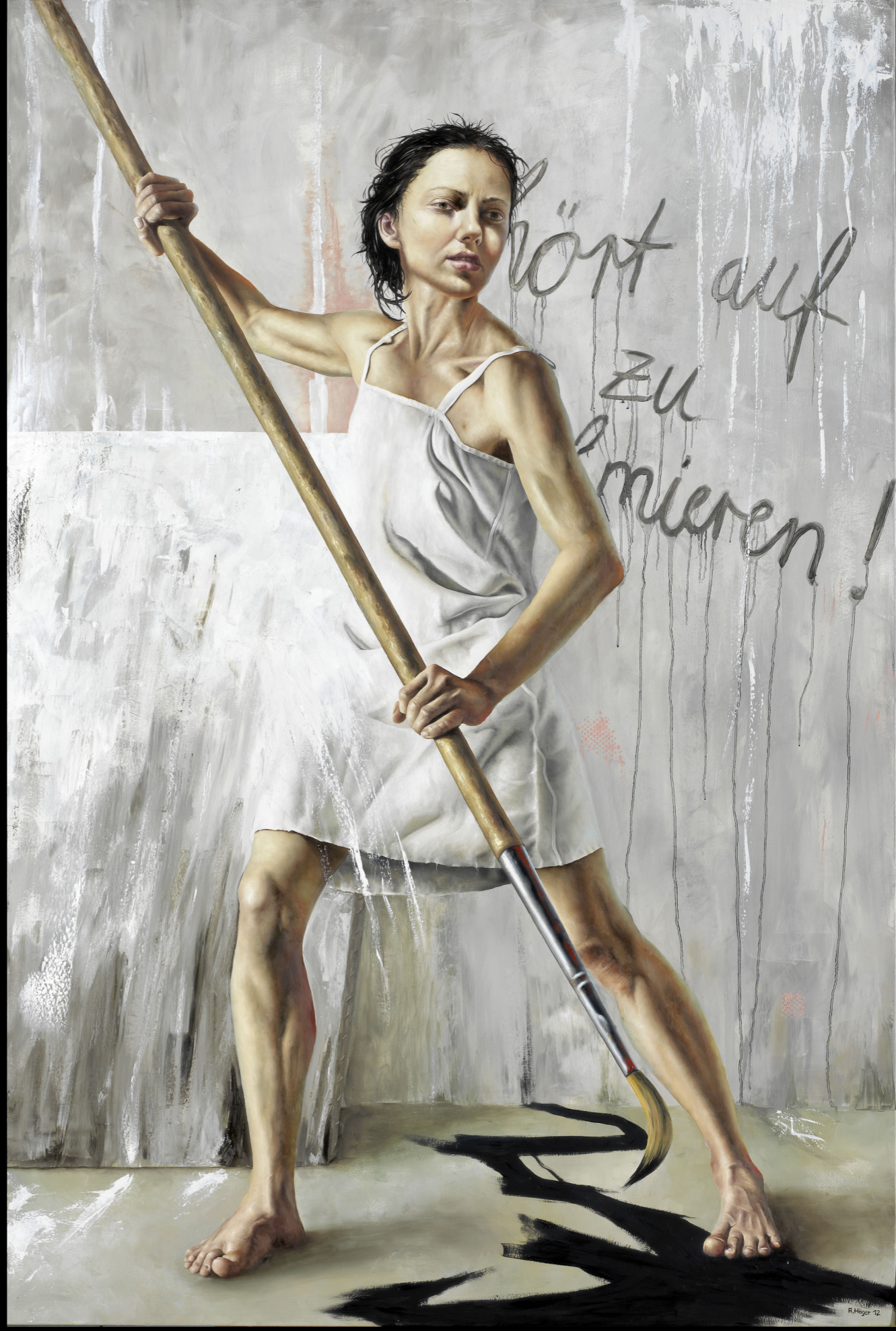
Stop smearing around Oil on canvas 180 130 2013