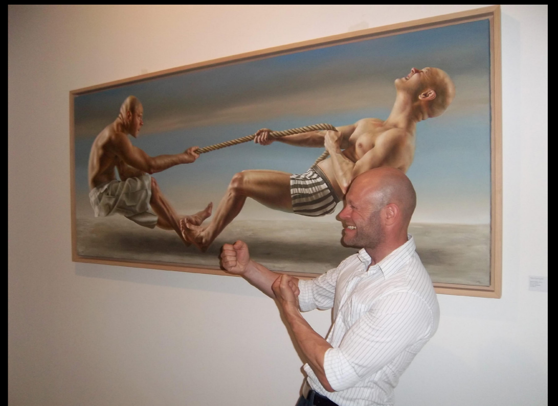
Model and the painting.