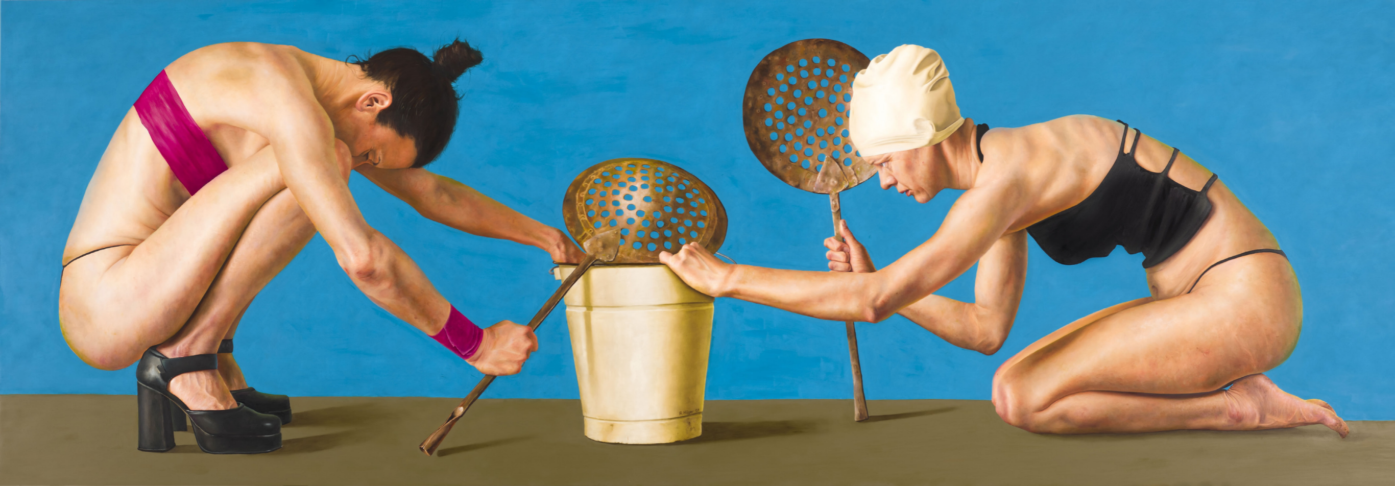
The Basket Oil on wood 229,6 cm x 85,6 cm 2017