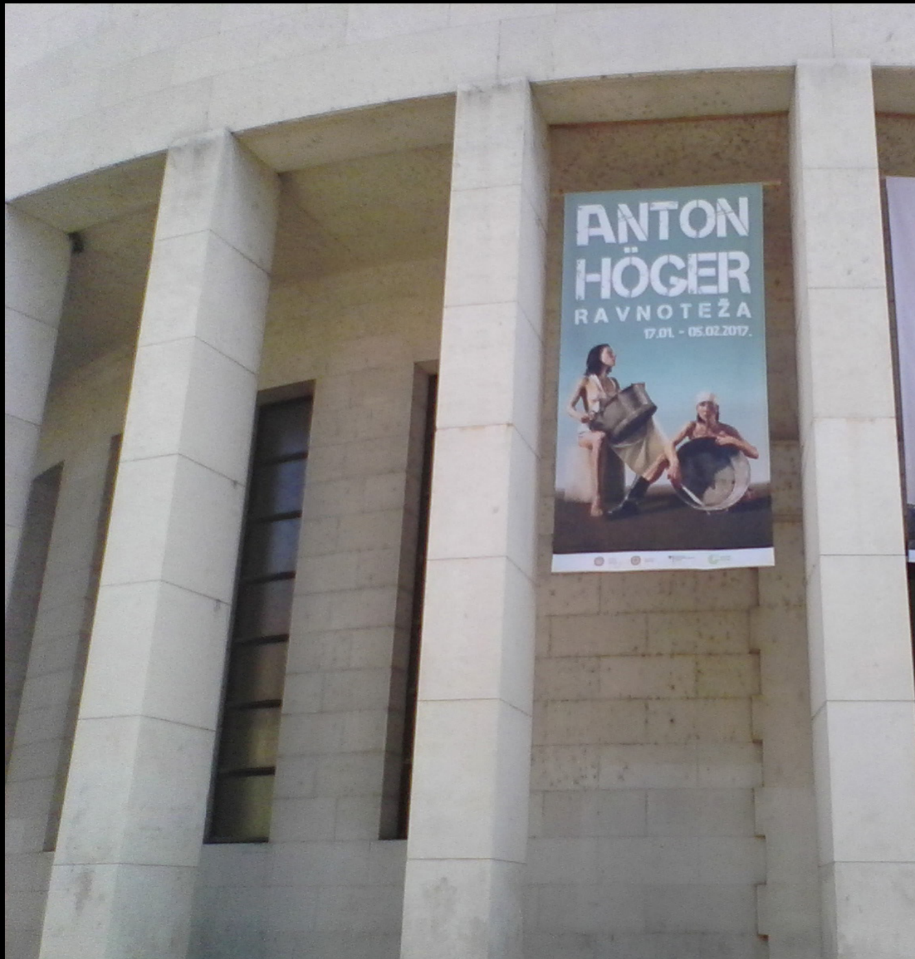
Banner at the „Mestrovich Pavillon“ - Museum in Zagreb.