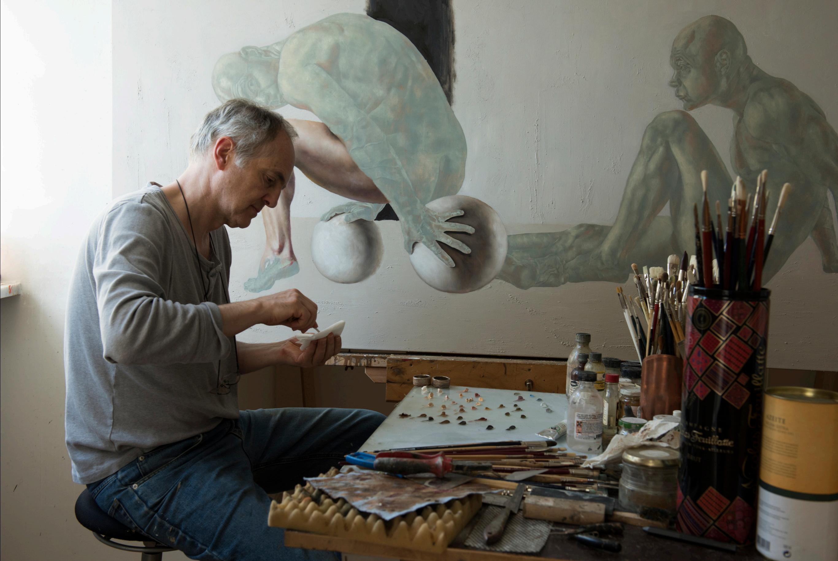
Artist in his atelier. 2016