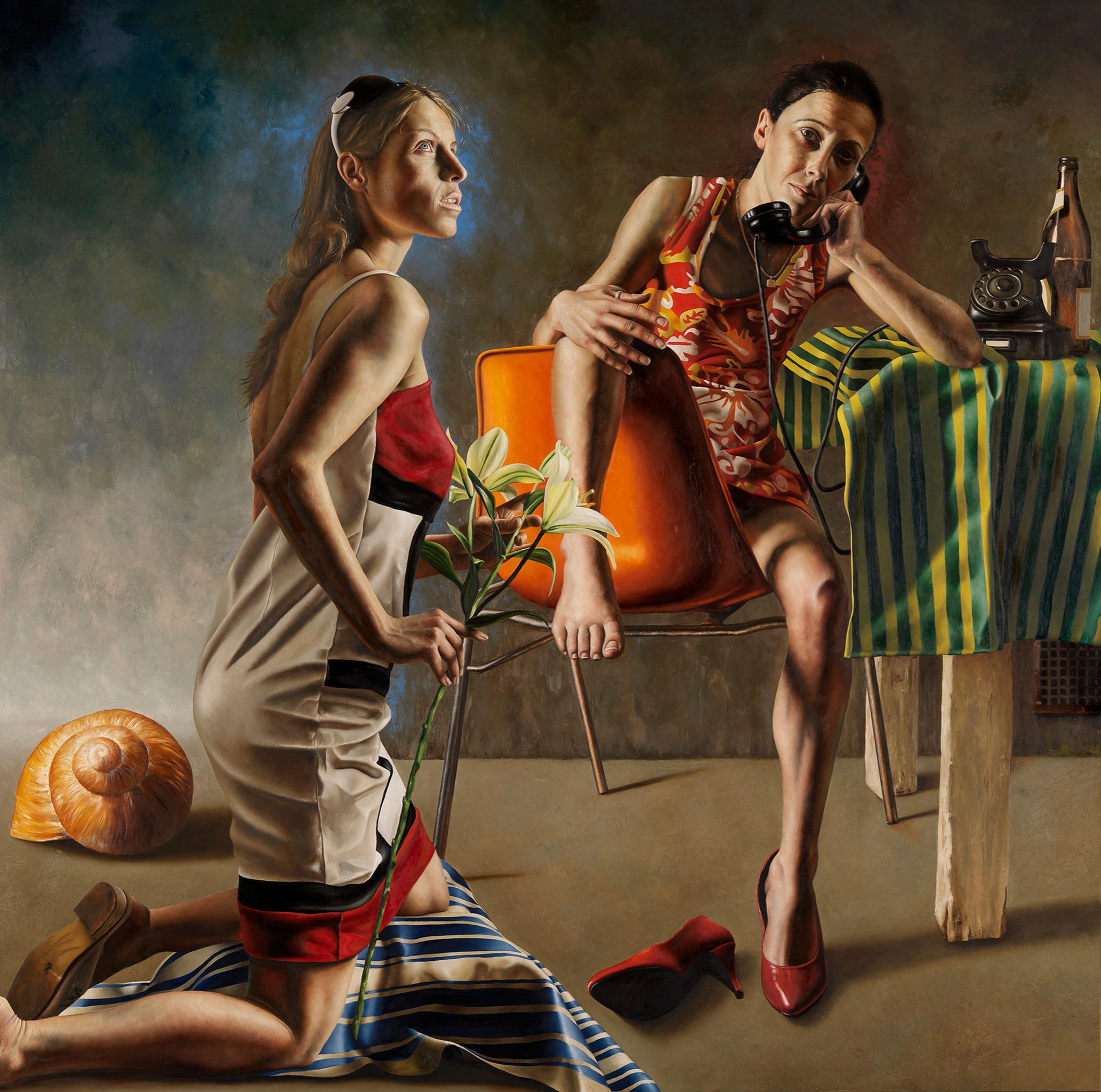
Annunciation Oil on canvas 140 cm x 140 cm 2008