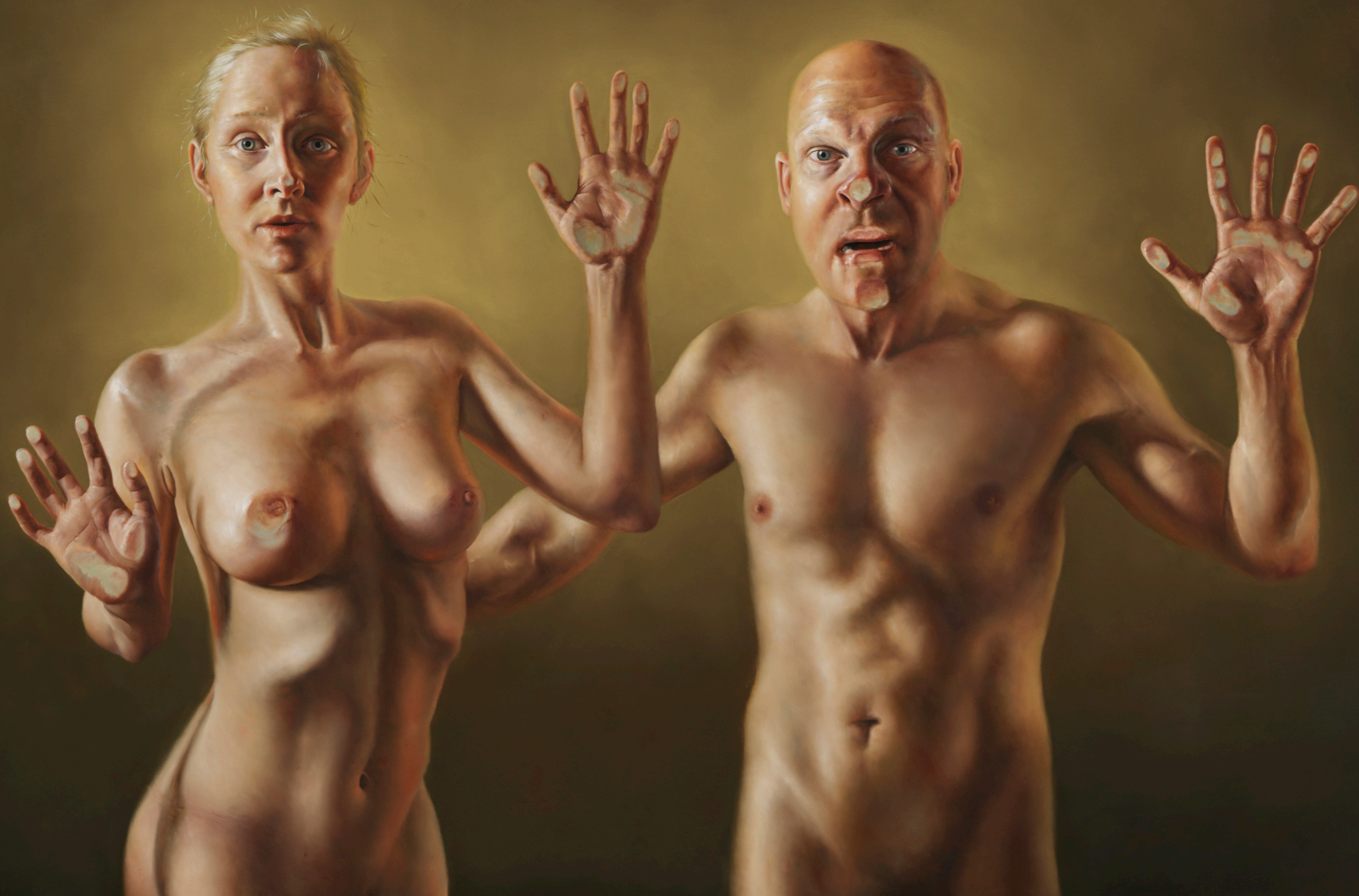
East of Eden Oil on canvas 110 cm 150 cm 2015