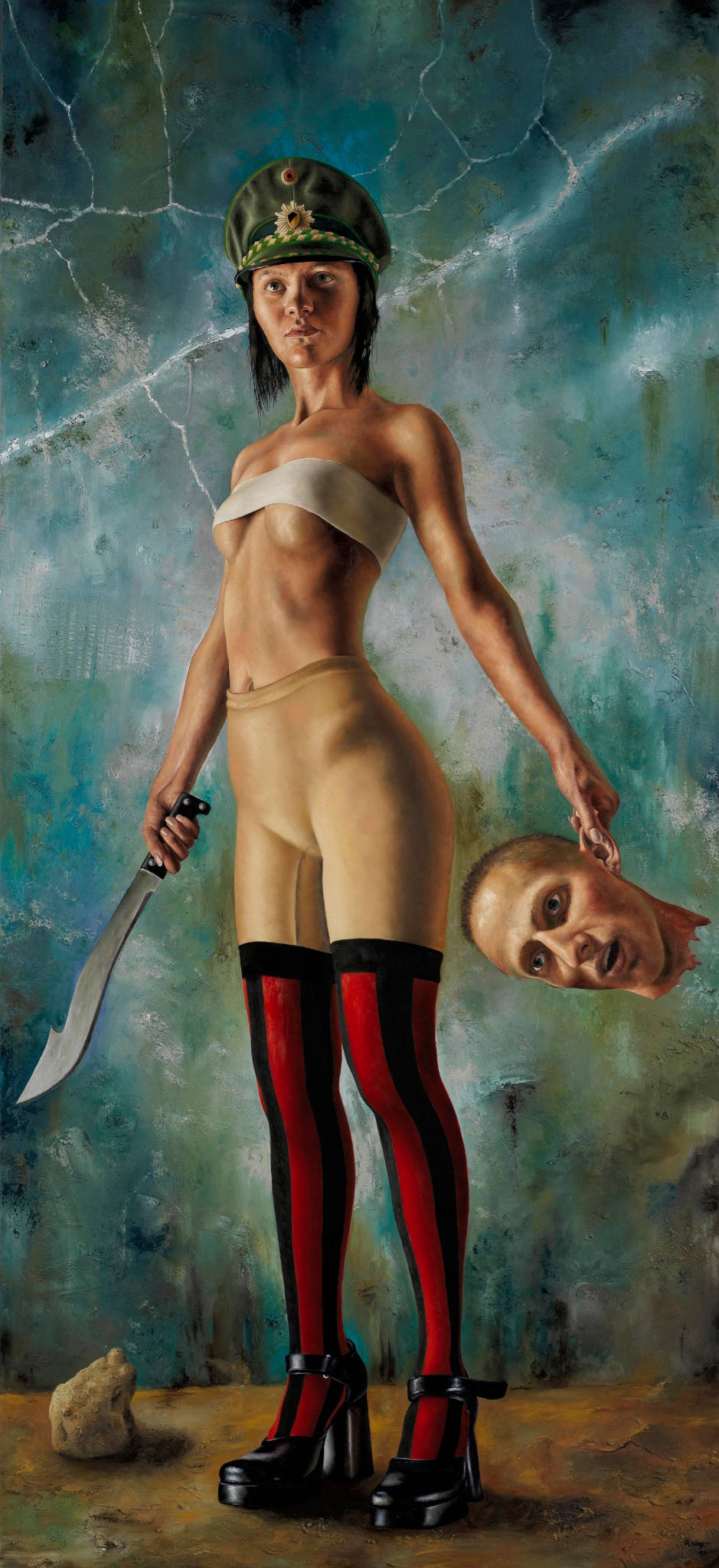
Judith Oil on canvas 200 cm x 90 cm 2011